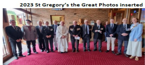
2023 St Gregory's the Great Photos inserted

All welcome to this special Mass service.