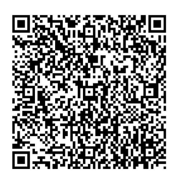
Location code BPR T8J

Thank you for your patience and understanding during this period.